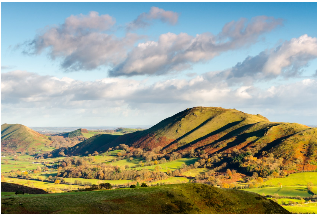
The Shropshire Hills, late autumn